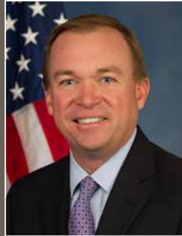
Mick Mulvaney United States Congressman Fifth Congressional District South Carolina