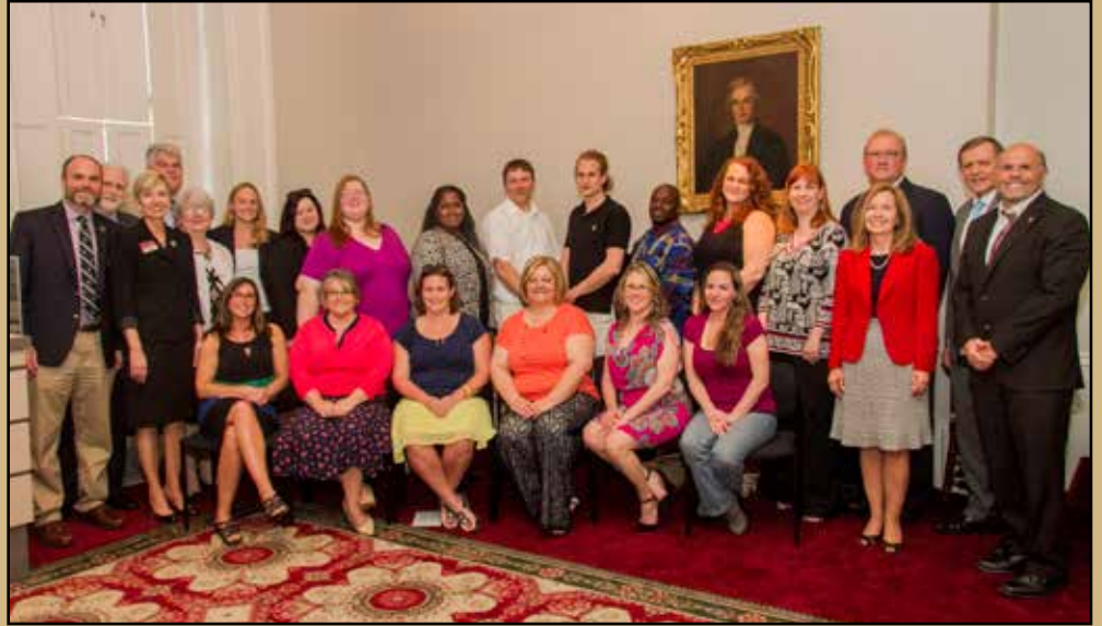
The students above were inducted to the Upsilon Zeta Chapter of Alpha Sigma Lambda honor society in 2015. The 2016 members will be inducted to the honor society in a May 5 ceremony.