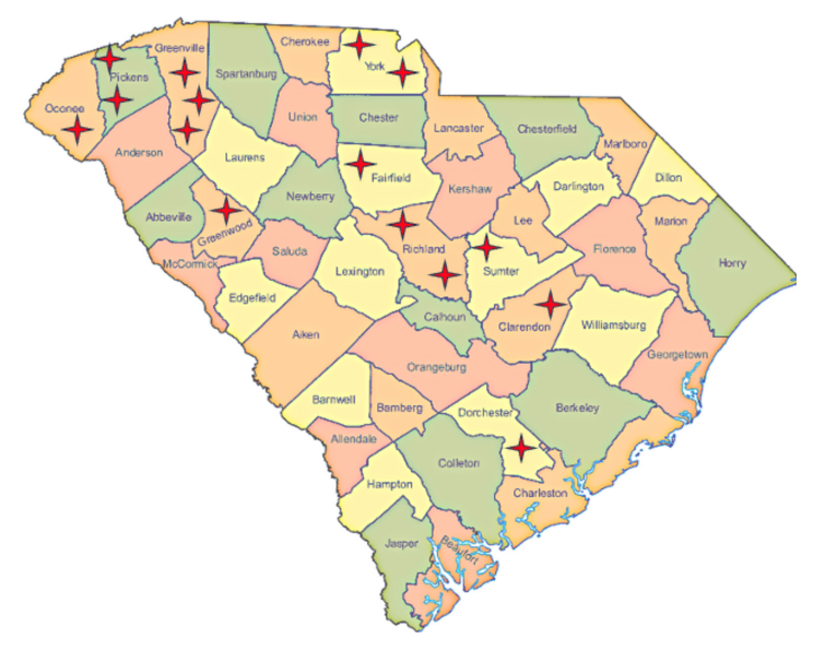
This is a visual representation of where participants came from across SC. The stars on the map represent that the participant was providing school mental health services within the county, and is not an exact location of the district they work in.

In spring 2024, the authors conducted interviews with 15 school mental health providers working in rural schools across SC to examine: 1) how their rural setting influences their work and 2) the specific challenges they face, as well as the supports they find helpful in addressing those challenges. Participants were asked questions such as, "What challenges do you face as a school mental health provider in a rural school district?" and "What types of training or additional supports could assist you in your role?"